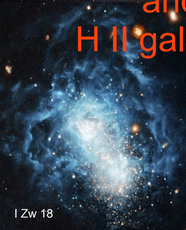
I Zw 18