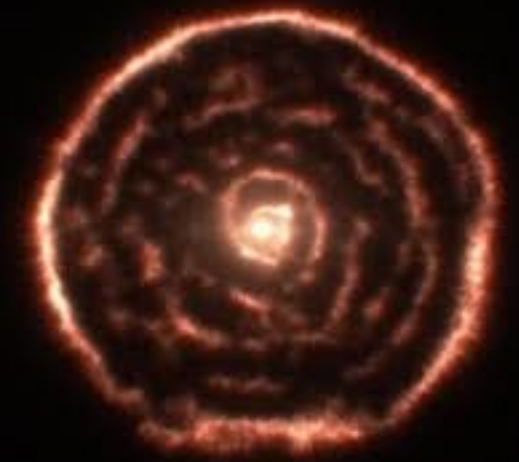
CO (3-2) map of Carbon AGB star, R Scl by ALMA